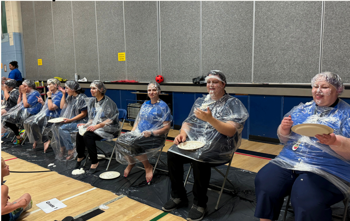
Jump Rope 2024 Pie the Staff Event